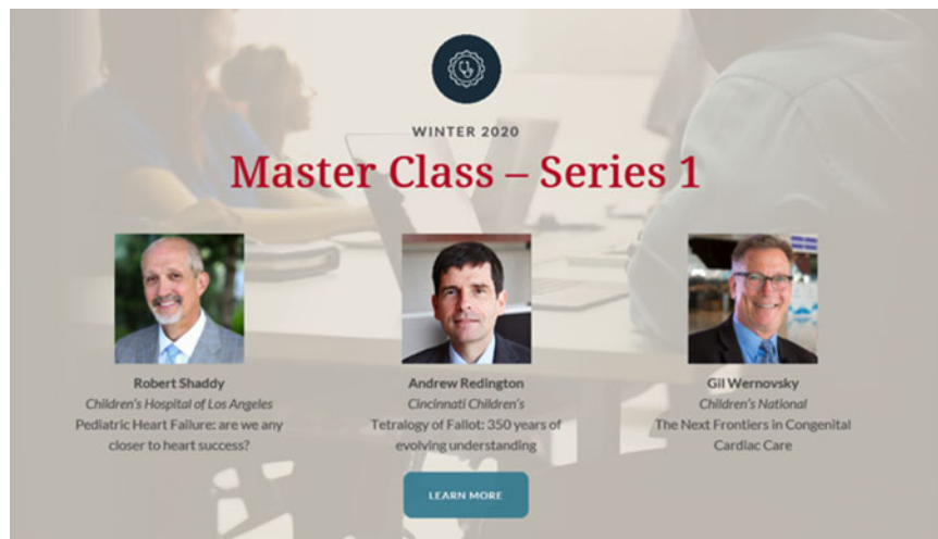
Figure 5. The Master Class Series.