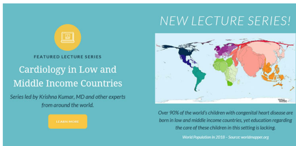
Figure 7. Cardiology in Low- and Middle-Income Countries Lecture Series.